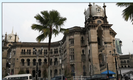
Railway station – British construction in Islam Style

countries till the end of Second World War. The natural sea ports of Malaysia helped them develop their trade. During the same period, Malaysia was under the sway of Japan also for sometime.