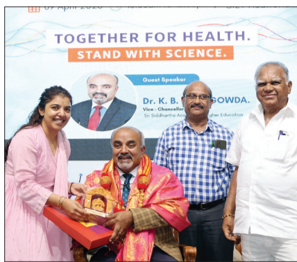
World Health Day celebrations in Shridevi Nursing College