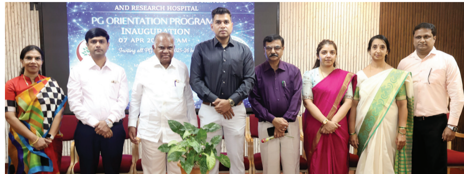
First year PG orientation Programme in Shridevi Medical College

The Medical condition, pain, problem of each patient are different from that of others. To understand this and treat such patients, doctors must acquire latest knowledge and gain practical experience. There is no single yard-stick that can be used uniformly in cases of all patients. You