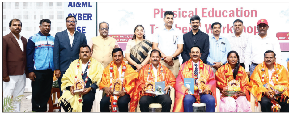
One-day Workshop of Physical Education Teachers in Shridevi PU College

Education must be comprehensive which should improve the all-round welfare of students. It should not confine to class room education and getting good marks in their examinations. Besides, they should have good bodily health and a strong mind also. Doctors of medicine help them maintain good bodily health while physical education teachers make their bodies strong enough to withstand physical pressure and psychological tensions. As some resource persons aptly said in the workshop physical effort leads to serene mind. A serene mind, leads to a good and quiet life.