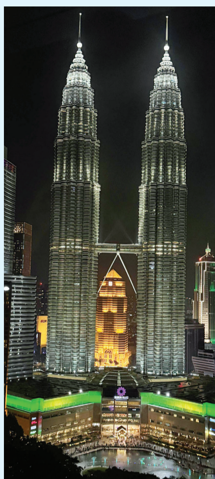
The tallest twin Towers in the world

The current population of Malaysia is 34 million. Though Malaysia is a multi-cultural nation, Islam is recognised as the official religion. Other communities have full right to follow their own religion. Malay, English, Chinese Mandarin and Tamil languages are the major languages of this country.